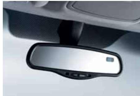
An electro-chromic mirror with compass (high grade models) automatically dims reflected light to provide welcome eye-relief during night driving and includes a handy electronic directional compass.