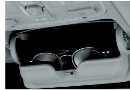
Handy overhead sunglasses holder, so they will always be within reach when the sun shines.