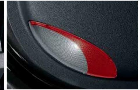
The courtesy lamps in the front doors alert upcoming traffic when the doors are opened at night.