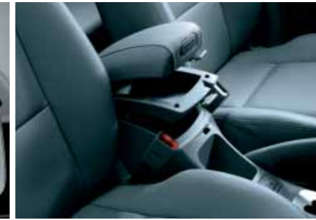
Front passengers will appreciate the dual cupholders and useful double storage unit in the centre console.