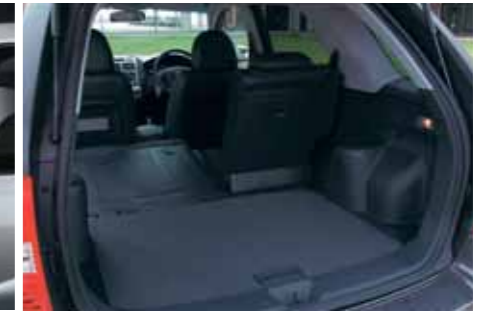
With rear seats folded flat, Sportage gives you up to 1,886 litres of load space and can swallow skis and other large items of up to 1,785 mm in length.