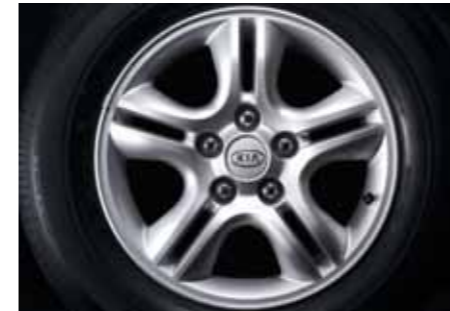
To complete the unique style and design of the Sportage, it is fitted with 16" or 17" alloy wheels - depending on the model you choose.