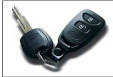
The buttons on the keyless entry system are marked for easy operation, something you'll appreciate when your hands are full. And for your personal security, it includes a panic button that sets off the vehicle alarm.