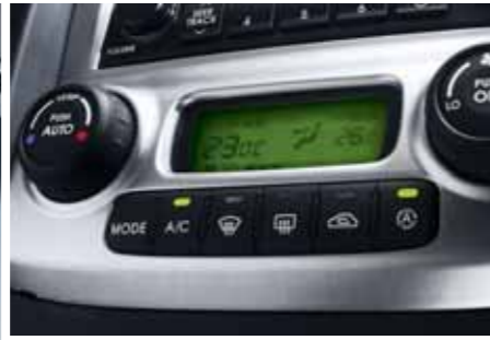
The air conditioning keeps you cool and comfortable when the temperature rises. On high grade models, the highly efficient climate control system offers fully automatic and adjustable temperature control settings.