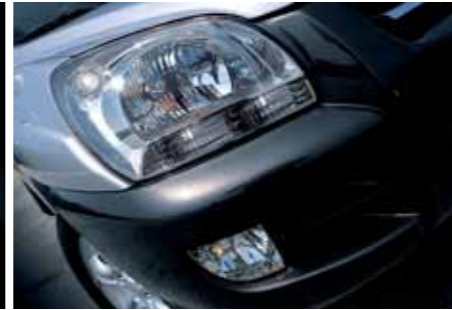
Using sensors to detect dusk, the headlamp auto light control system turns the headlamps on and off, including when you're driving through tunnels.