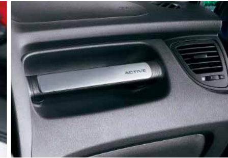
The dashboard assist grip provides extra comfort and stability on twisty and bumpy roads for your passenger.