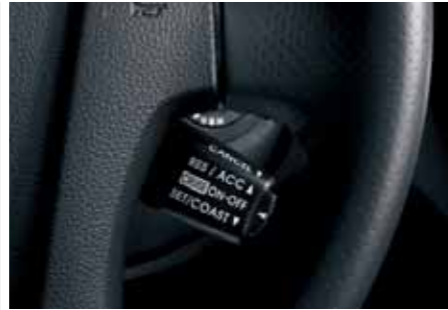
The cruise control (high grade models) is a welcome convenience on those long drives.