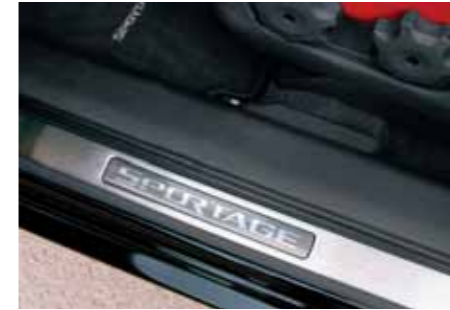
The metallic door scuff plates protect your vehicle from damage (high grade models).