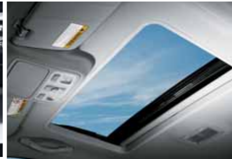
On sunny days, you'll appreciate the electric tilt and slide sunroof (high grade models).