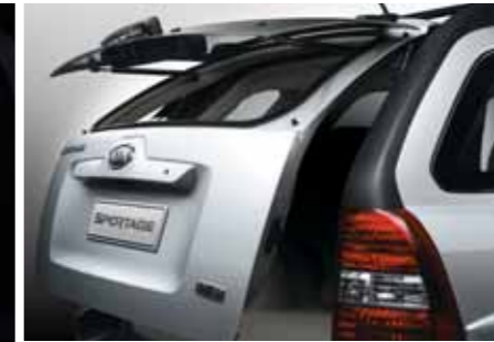
The top-hinged tailgate comes with flip-up glass that makes for a nice touch of convenience when you need to quickly drop some small items into the boot.